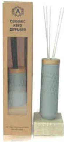
ATIN Ceramic Reed Diffuser - Peacock Green From $39.00 $44.00