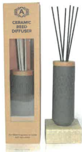
ATIN Ceramic Reed Diffuser - Charcoal Grey From $39.00 $44.00