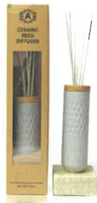
ATIN Ceramic Reed Diffuser - Grey From $39.00 $44.00