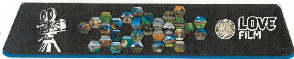
ITEM: KEYBOARD MAT