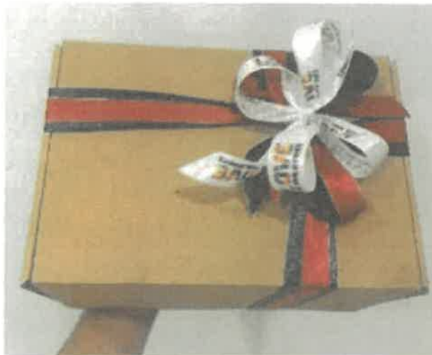
CRAFT BOX (11 INCHES X 8 INCHES X 5.5 INCHES)