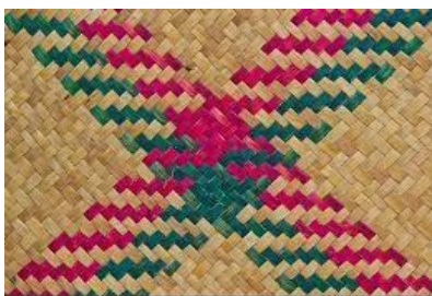
Weaved Mat-Base With Clear Cover On Sides and Top